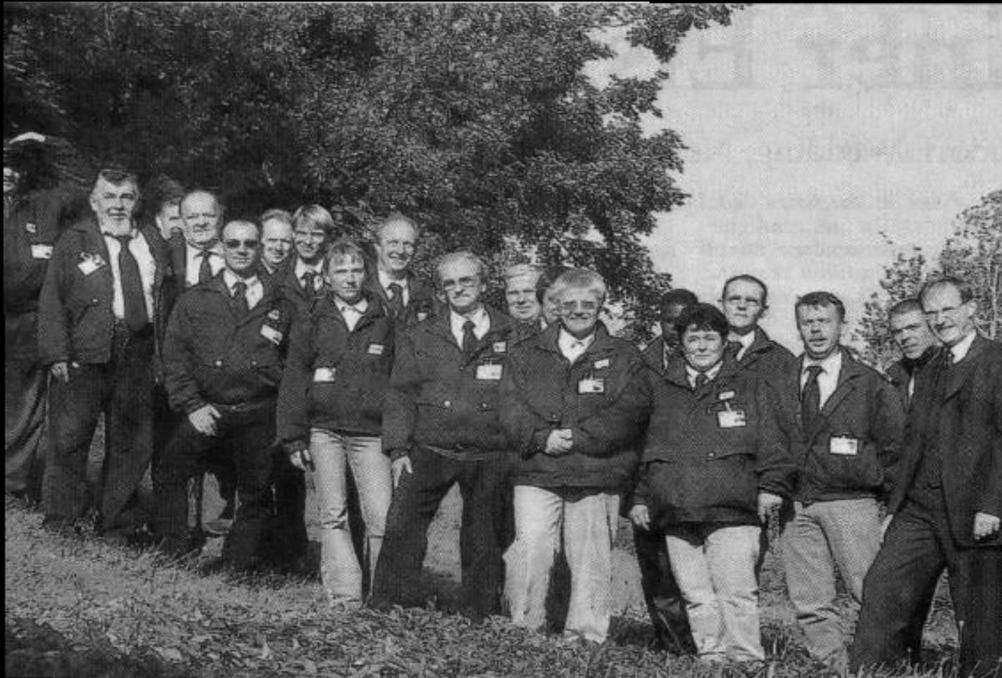
Nonprofit park patrols in Berlin