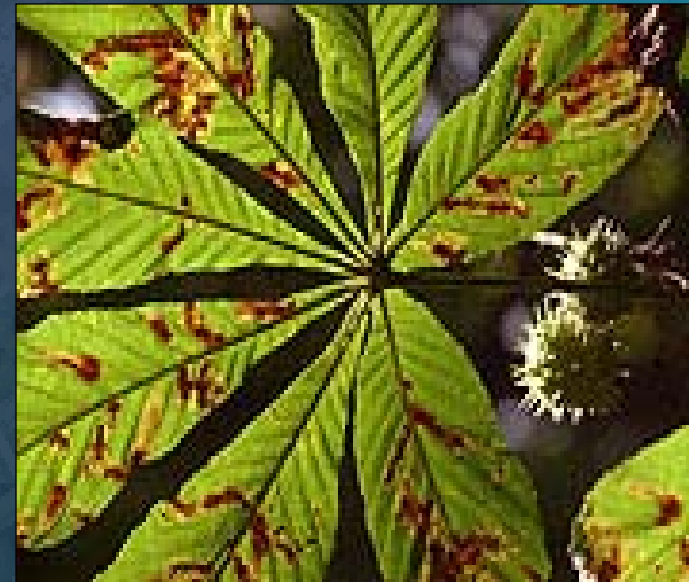
Moths' attack – Miniermottenbefall ( Cameraria ohridella )